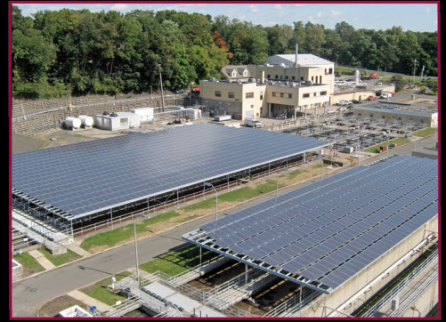
NWBCUA, Bergen County, NJ