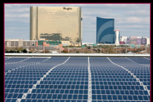
Atlantic City Convention Center