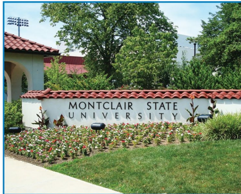
Montclair State University