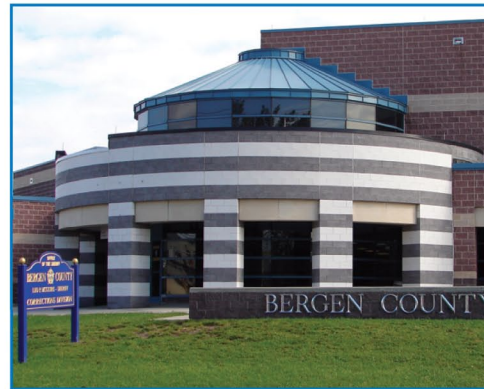
Bergen County Correctional Facility