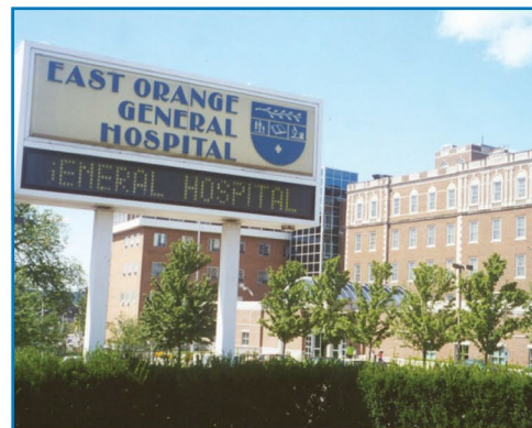
East Orange General Hospital