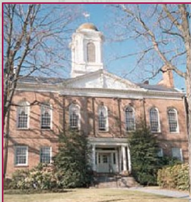
Historic Morris County Courthouse

Metro Energy provides a wide range of customized services to meet the energy needs of clients in a variety of markets, including government buildings (State, County, and Municipal); K-12 schools; colleges and universities; health care facilities; water and waste-water treatment plants; sports complexes; apartment buildings; and the commercial and industrial sectors.