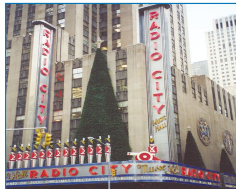
Radio City Music Hall